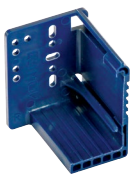
MUV-RBP Plastic Rear Mounting Bracket Sizes 9–12"