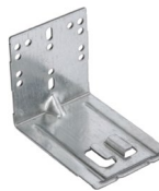
MUV-RBM Metal Rear Mounting Bracket Sizes 14"+