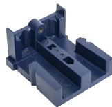
MUV-124 Installation Jig